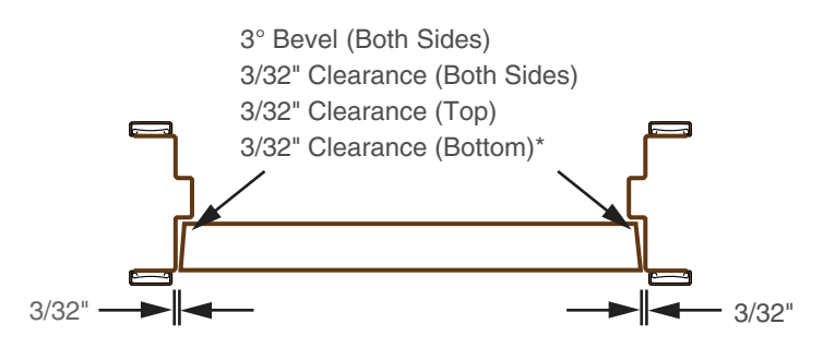
*Additional clearance is required for Thresholds and various floor conditions.

+ Frame Heights are 3/16" longer than callout door height unless ordered net. (3/32" top, 3/32" bottom for clearance).